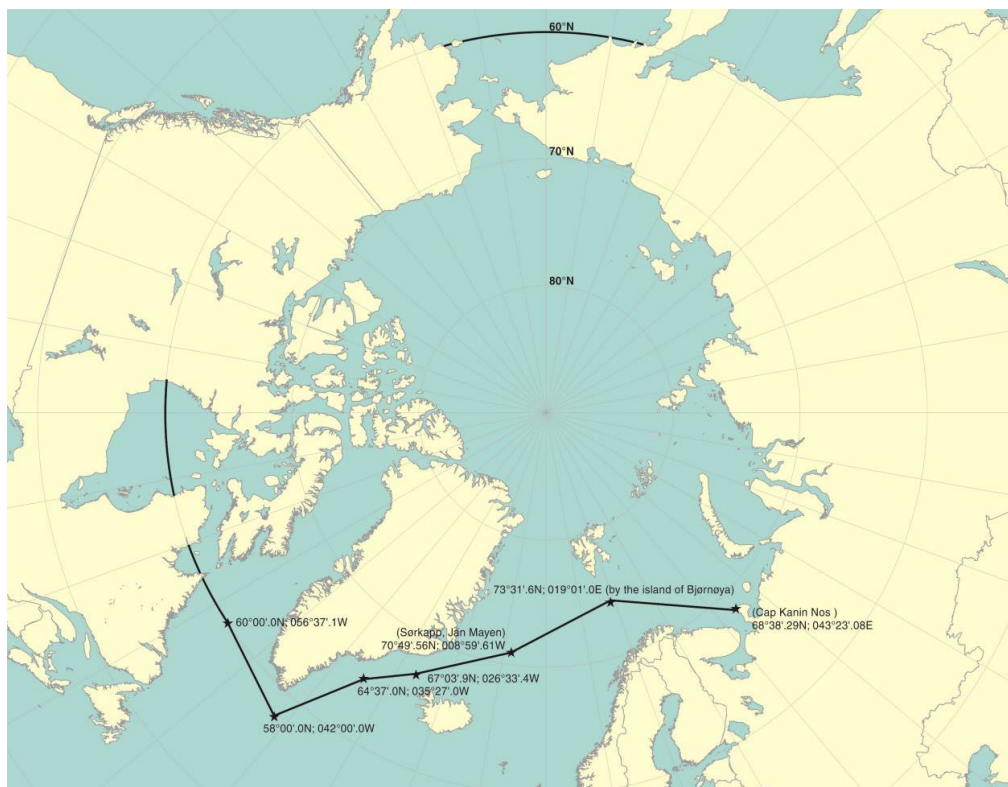
Figure 2 – Maximum extent of Arctic waters application