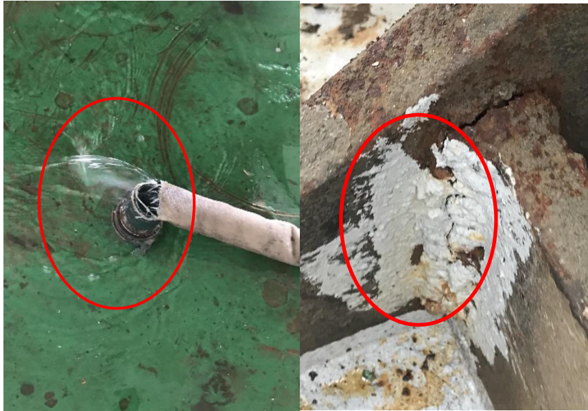
Figures 2 and 3: Burst fire hose (left) and cracked weld (right).