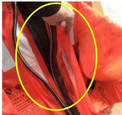
Figure 1: Immersion suit zippers were found defective.

This MSA is evaluated annually by the Administrator and expires one year after its issuance or renewal unless otherwise noted, superseded, or revoked.