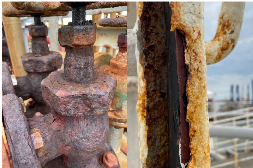
Figures 4 and 5: Typical on-deck condition (left) and watertight door (right).